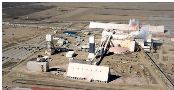
Vanscoy Mine Potash

Traditionally this was done using tape extensometers and displacement sensors, but these were complicated, expensive and challenging to use because they could obstruct the tunnels. To overcome these challenges, Nutrien decided to adopt laser displacement sensors instead. These cost about a third of the price of a tape extensometer. All the company needed to do was find a reliable and cost-effective way of getting the data from the displacement sensors underground to the visualization systems above ground.