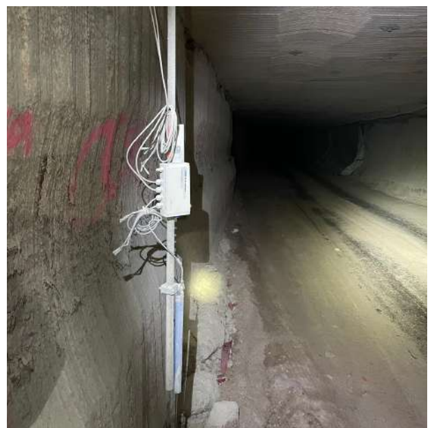
Multiple GMM's and closure rod connected to 4ch Analog node