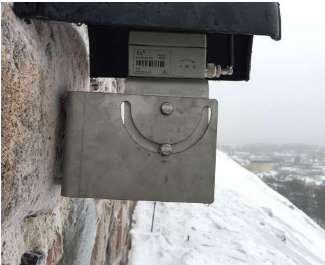
Worldsensing wireless tiltmeter installations